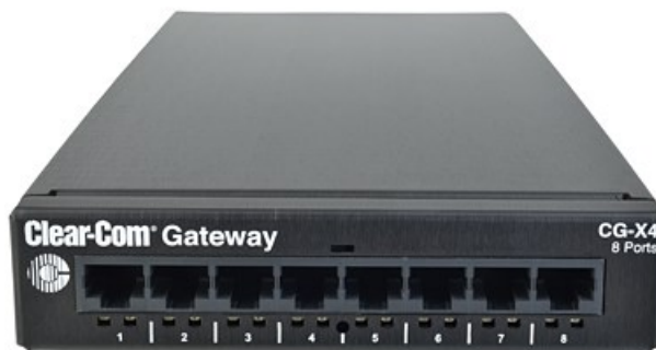
Clear-Com Gateway CG-X4

Clear-Com recently announced the launch of its new Gateway family. The modular CG-X1 and CG-X4 devices are designed to link and bridge disparate communication systems such as IP networks, telephone networks, radios and intercom systems. Clear-Com Gateway is a good solution for on-site communication across different frequencies for government, military, public safety agencies and many other applications.