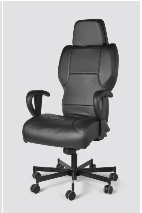
High Back Executive 3142